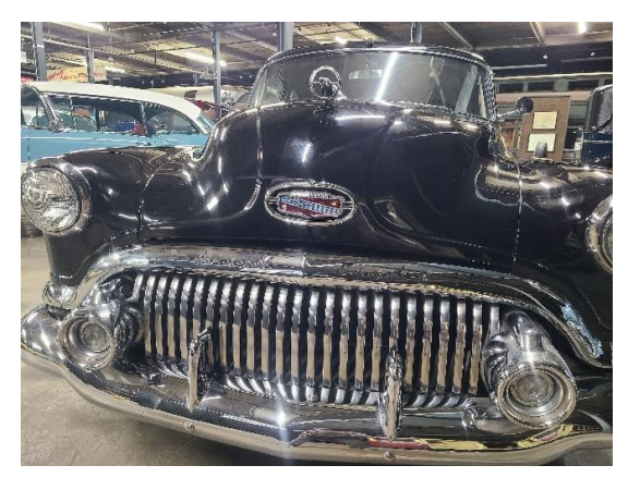
You won't want to miss this one, so come to the Forney Museum and celebrate the history of Buick with us!